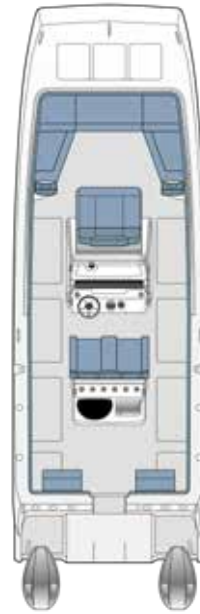
OPTION MAIN DECK