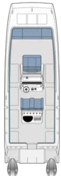
STANDARD MAIN DECK