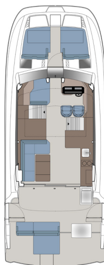
MAIN DECK (Inboard Engines)