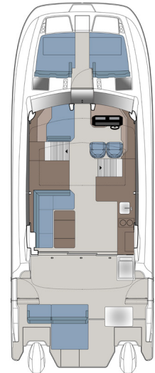
MAIN DECK (Outboard Engines)

All specifications and options are subject to change by Sino Eagle Yachts at their sole discretion. Performance is purely indicative and not a contractual commitment. Performance is subject to many variances outside the control of Sino Eagle Yachts. Specifications and graphics in this brochure are non-binding and customer must enter into contractual agreement with the Dealer or Agent of Record.